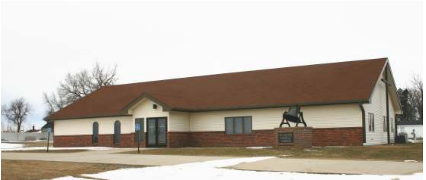
Erland Carlson Photos